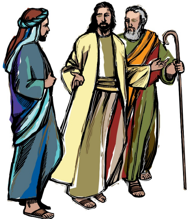
On the Road to Emmaus

They were at the tomb early in the morning, and when they did not find his body, they came back saying that they had even seen a vision of angels, who said that he was alive. Some of those who were with us went to the tomb and found it just