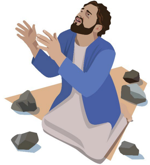
STEPHEN BECOMES THE FIRST CHRISTIAN MARTYR

"You stiff-necked people, with uncircumcised hearts and ears! You are just like your fathers: You always resist the Holy Spirit! Was there ever a prophet your fathers did not persecute? They even killed those who predicted the coming of the Righteous One. And now you have betrayed and murdered him-- you who have received the law that was put into effect through angels but have not obeyed it."